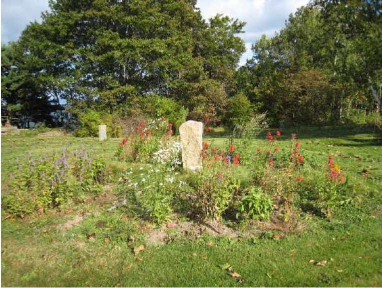
The round bed in September