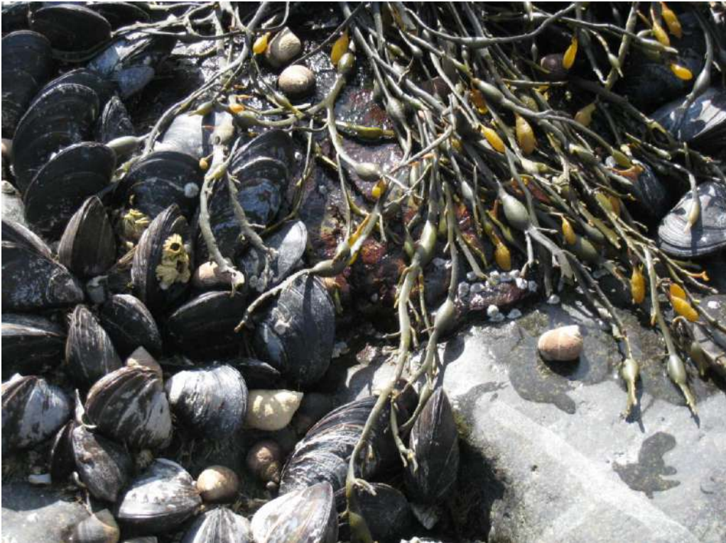
Knotted Wrack, Blue Mussels, Common Periwinkles and barnacles

I stand on the sunny pier-side beach, holding a large female Jonah Crab. I've frightened away the gull which plucked her from the shallows before my eyes, but what should I do with her now? Return her to the predator-haunted sea? Put her in the Dorr Museum touch tank, protected and serving an educational purpose but removed from her ecosystem and regularly handled by humans? After three weeks at COA, I face my first practical quandary about how to interact with the natural world.