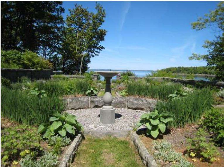
The garden in May (partial view)