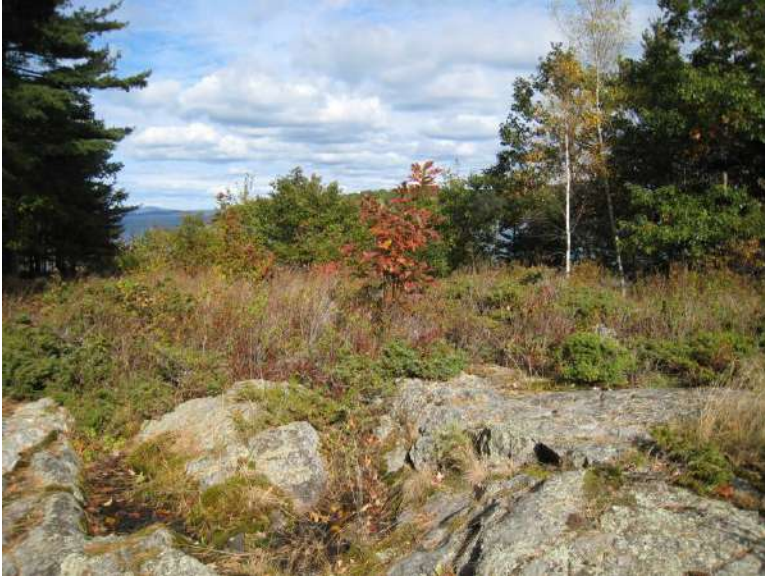
The meadow in autumn