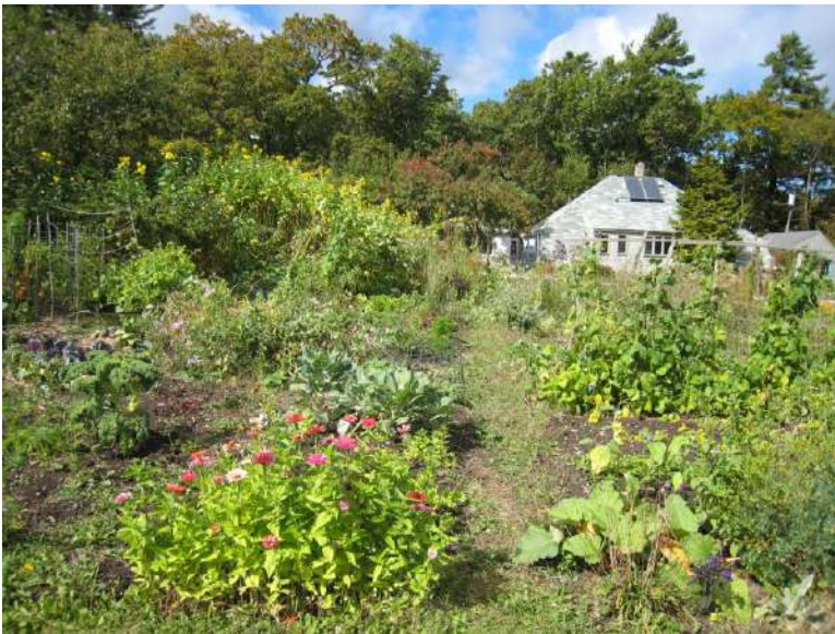
Part of the lower garden in September

Yellow and bi-colored daffodils bloom first, in clusters around the lower garden's border. Gardeners tend some beds, while others are rapidly overrun by edible but unwelcome dandelions. Leafy crops such as chives and rhubarb emerge, becoming more diverse by the week. By May, when white blossoms fill the orchard trees, the garden is back in business.