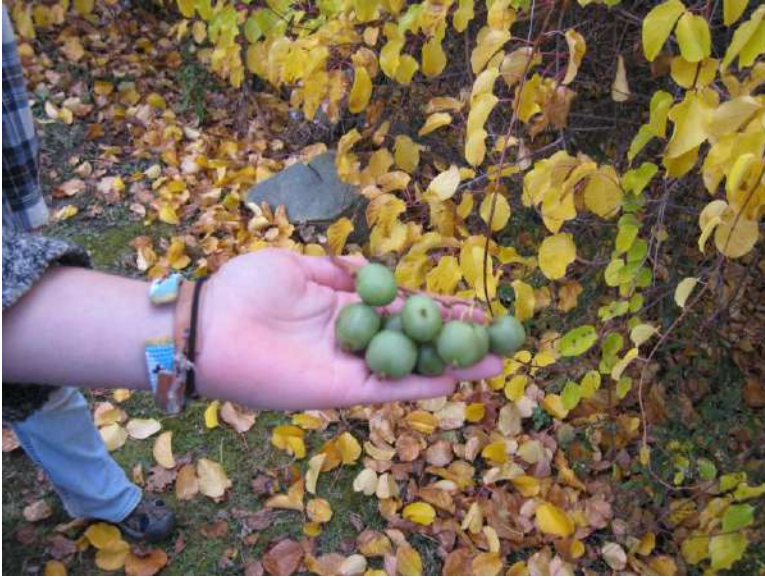
Hardy Kiwi fruit