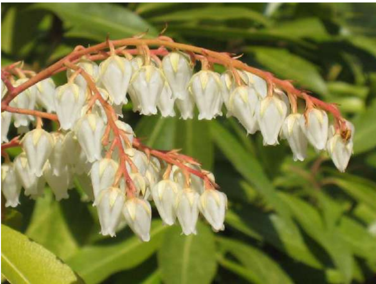
Mountain Pieris flowers