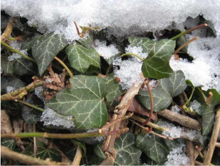
Grape leaves in winter

I sit on cool grass beside a cedar, against the wall of Kaelber Hall's balcony. It's a sunny blue-and-green day in spring, or maybe autumn, and I'm eating breakfast, or maybe lunch. A chipmunk appears, circling me warily as I sit very still. It moves from my line of sight and – for just a moment – I feel its tiny forepaws on my lap.