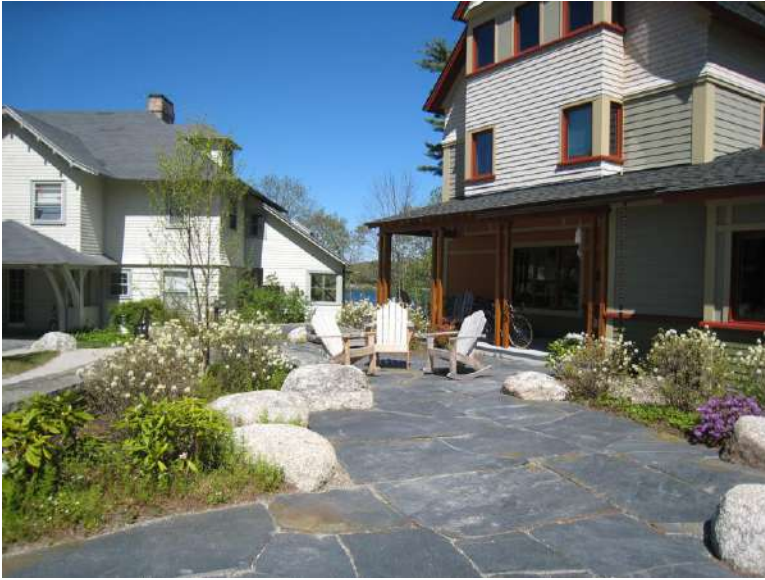
Millard House and Seafoam

I crawl across dusty, matted grass, growling in my throat as I scan the April night. It's my first time playing "zombies," and a boy's bite has zombified me. My prey is out there, somewhere, darting through darkness and lamplight between forbidden, golden-lit buildings.