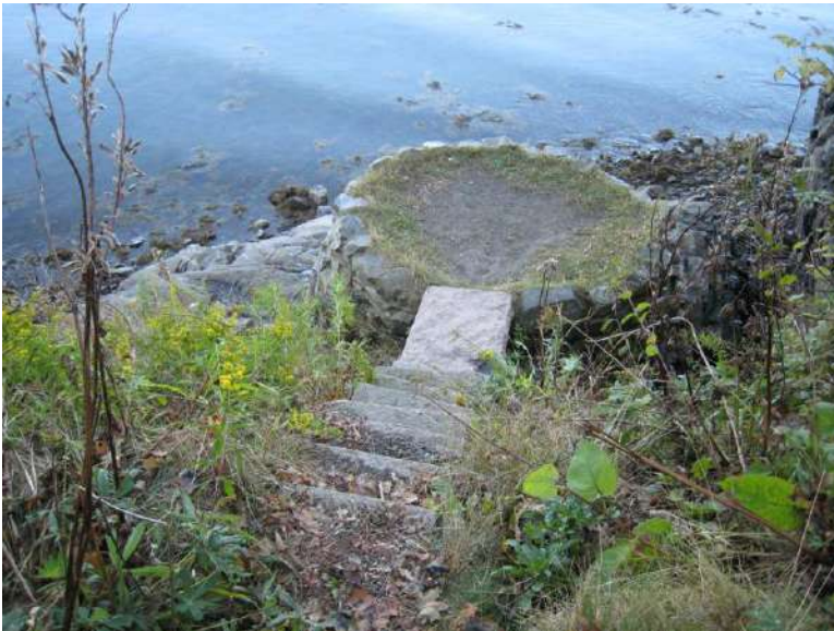
View from the path at semi-low tide