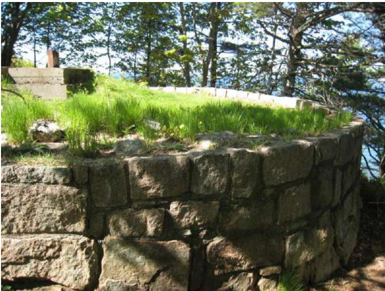
View from the top of the Shore Path

The stone circle was originally a porch of Beau Desert cottage (see Shore Woods), and is the last remnant of that lavish cottage. The Oblate Fathers added the cross in 1959; covered in blue neon lights visible from across the bay, it became a beacon for ships and a landmark still remembered by lifetime locals. In the 1970s, COA students replaced it with a windmill which burned down in the 1980s, ignited by the friction of its own movement.