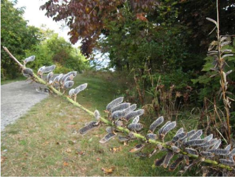
Lupine with seedpods