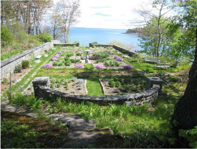
The garden on an April morning

I kneel beside a mini azalea, watching a bee crawl from one flower to another. It's the spring of 2007, and mysterious honeybee die-offs across the nation are raising fears for the future of our crops. Bowed before the small laborer, I think: The gift of pollination should never have been taken for granted.