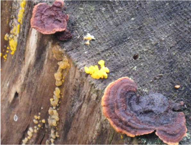
Shelf fungi and Orange Jelly Fungus

I crawl across the ground, wild with surprised excitement. I've come seeking acorns for autumn wreaths, and found few good ones under the scattered oaks on the museum's other side. Here near the road, hundreds nestle in the grass, gleaming brown against patches of starry emerald moss. I dig them out and sort them, choosing the most flawless, the ones still attached to their caps in clusters of two and three. Still more acorns fall around me with dangerous-sounding impacts, but I don't care.