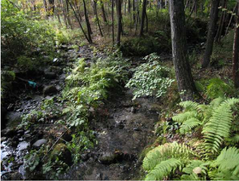
Upstream view from the bridge in autumn