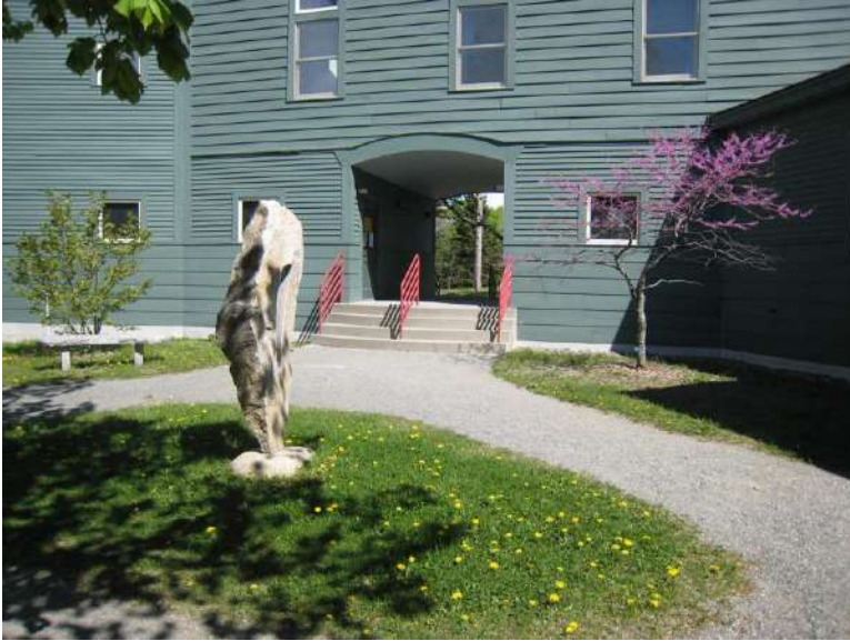
The courtyard in early May