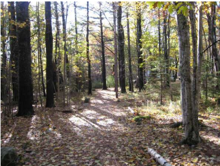
A path near Witchcliff in autumn