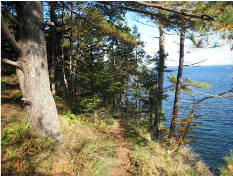
The northern ledge path

Japanese Barberry spines pierce my gloves and hands. I struggle to cut through a bush's base, my shears gnawing ineffectively at the fibrous yellow wood. Berries patter to the ground around me, sowing new bushes. Other people work nearby, volunteering their time on a cold gray autumn day to attempt combating this tenacious invasive plant.