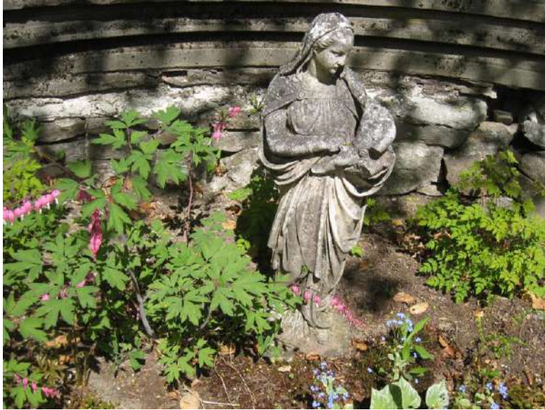
Virgin Mary statue amid Bleeding Heart and Siberian Bugloss