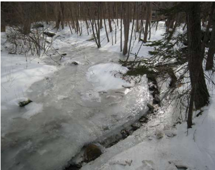
The same view in winter; water is flowing in an ice channel