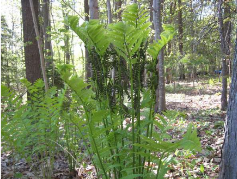
Interrupted Ferns with fertile (dark) leaves

Wood Frogs, which spent the winter frozen solid on the forest floor, breed frenetically in the pools for two early-April weeks. Their quack-like calls give way to the chirps of Spring Peepers, which usually continue well into May, although cold or dry weather may silence them. Shadbush (also called Serviceberry and other names) bears white flowers in late April, which become edible purple fruits in summer. Japanese Knotweed – a rapidly-spreading invasive plant – rises from the pools, and students eat its crisp, sour young stems.